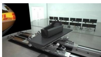
aVDS with single seat tub